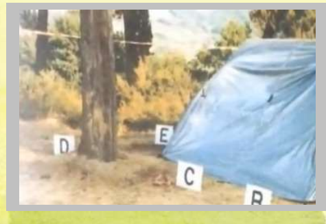
Monster of Florence crime scene photo

REGISTER for CRJU 490/690 and/or CRJU 408/608 in person or by phone (562) 985-5561 at the Center for International Education (CIE) or online at: