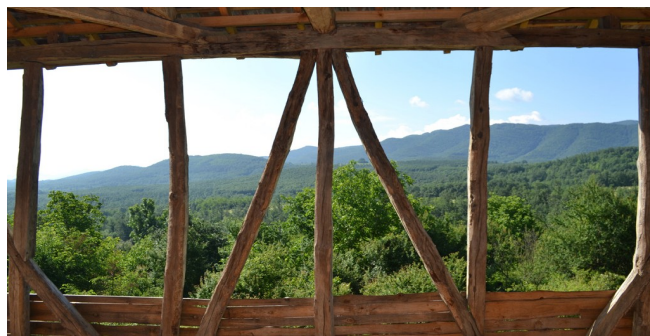
View from the 300 sq meter barn at the Stone & Compass Center