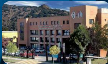
Santiago Campus Las Condes