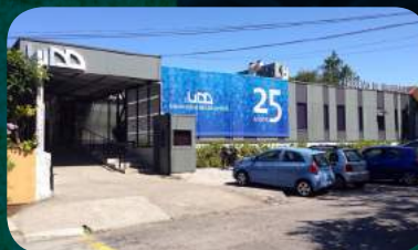
Concepción Campus Pedro de Valdivia