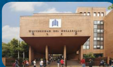
Concepción Campus Ainavillo