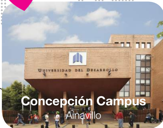
Concepción Campus Ainavillo